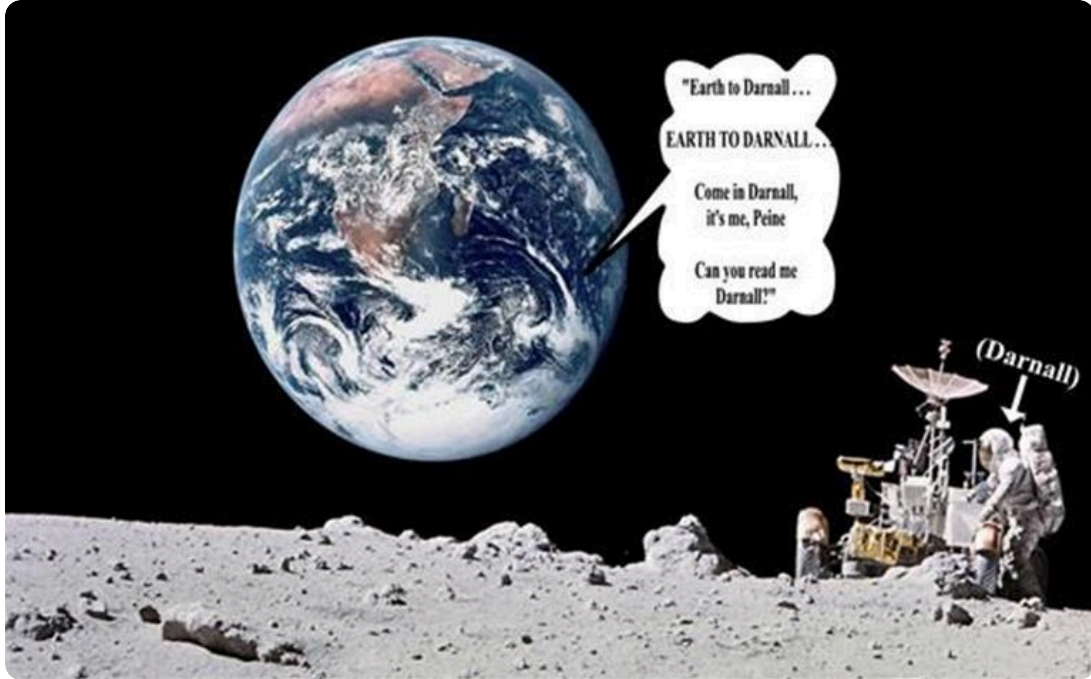
So Far Away