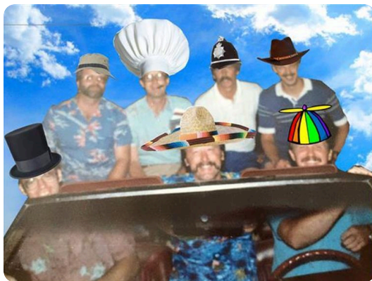
The Happy Minier Reprobates