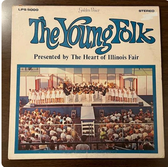
The Young Folk