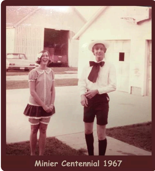
Minier Centennial 1967